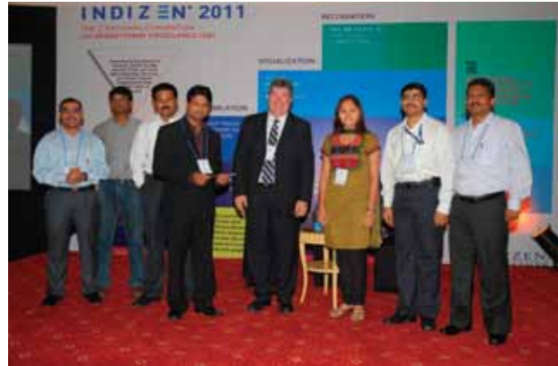
Recipient of Imai Award for Operational Excellence, Pune, India 2011

Join us in this conclave to understand how these two big themes of the future, come together, stay together and deliver more together!